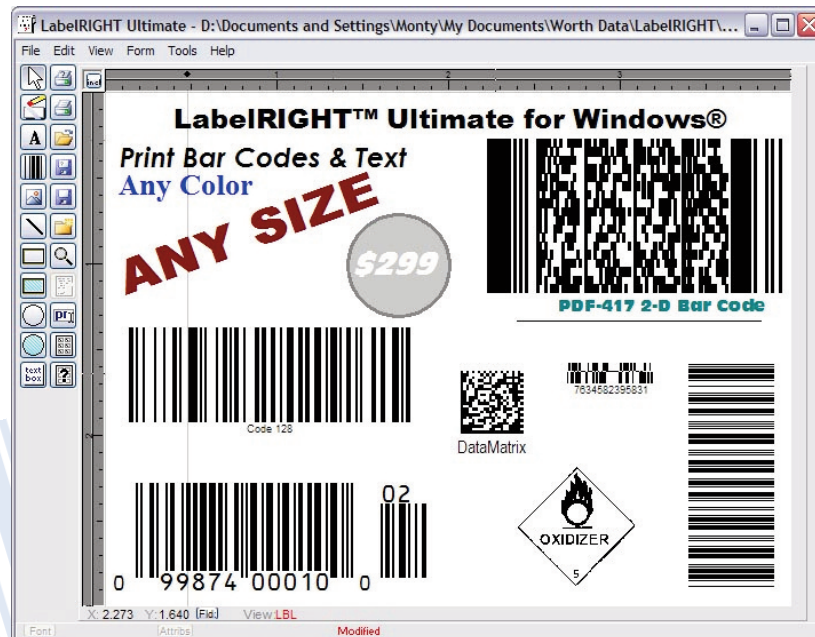
Our Full Featured Graphical Interface

See our website for information on our Worth Poly™ Polyester Laser Label Stock - you won't find a more durable label!